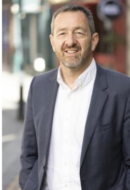
Chris Boardman CBE Chair of Sport England